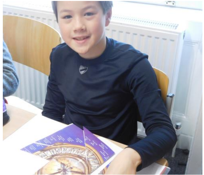
Making Alethiometers in Year 5