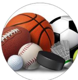
Multi-Sport Club with the Games Department