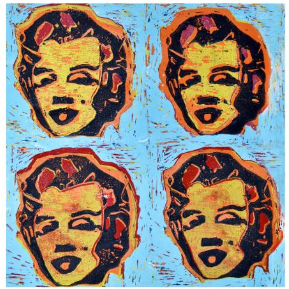
Cameron Timlin, 8V