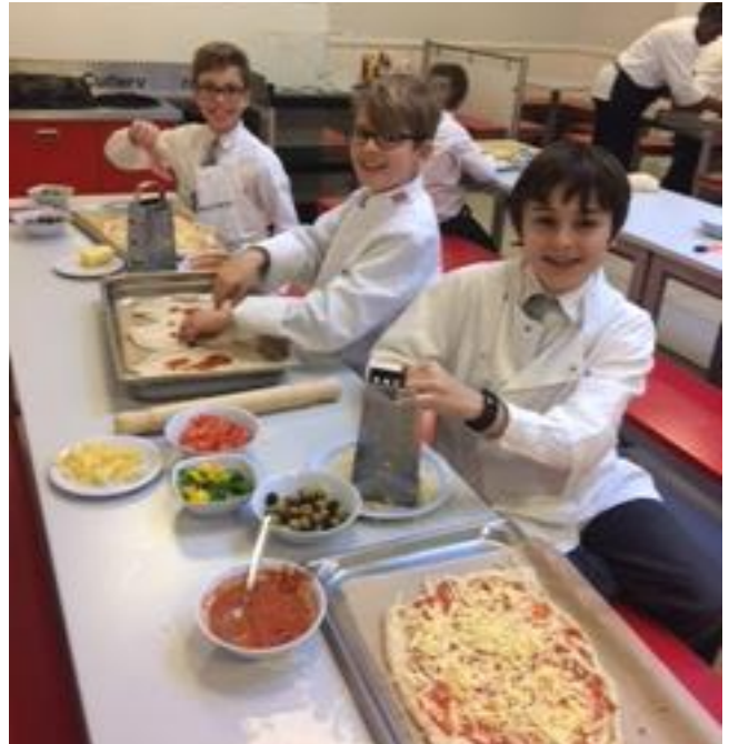
Pizza making in Cookery Club!