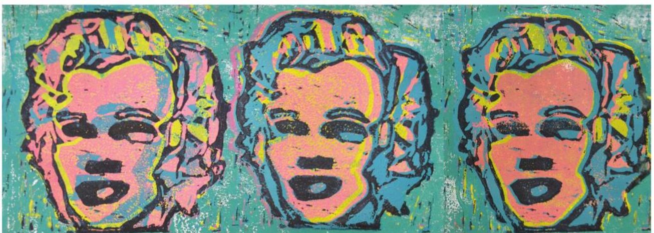
Salar Moghadam, 8V