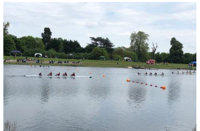
Eton Dorney Regatta