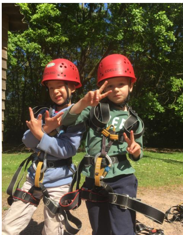
Fun at PGL!