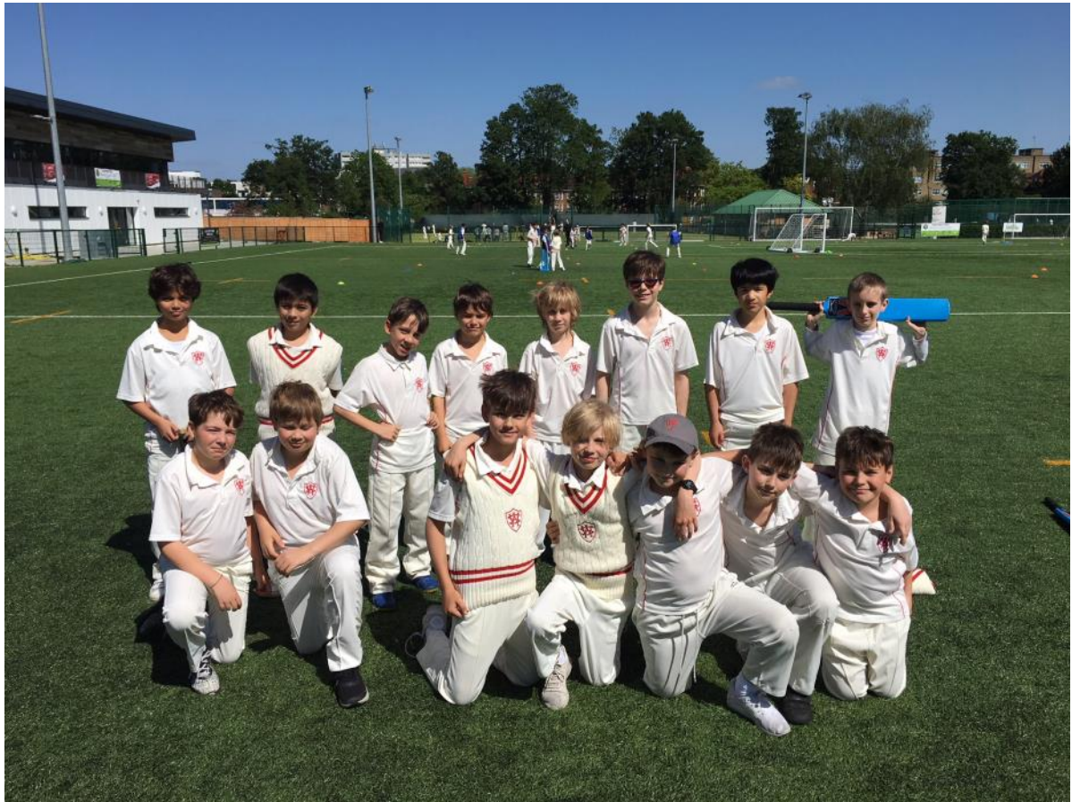
The Cavaliers and Shamrocks team photo and a celebratory floss!