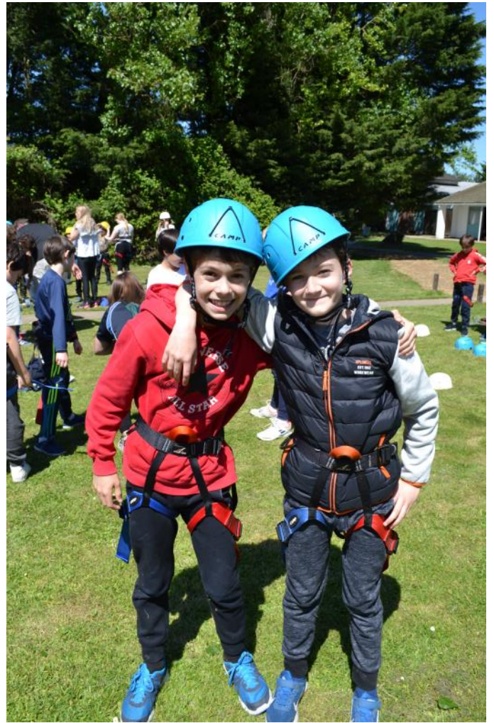
Year 4 ready for the high ropes!