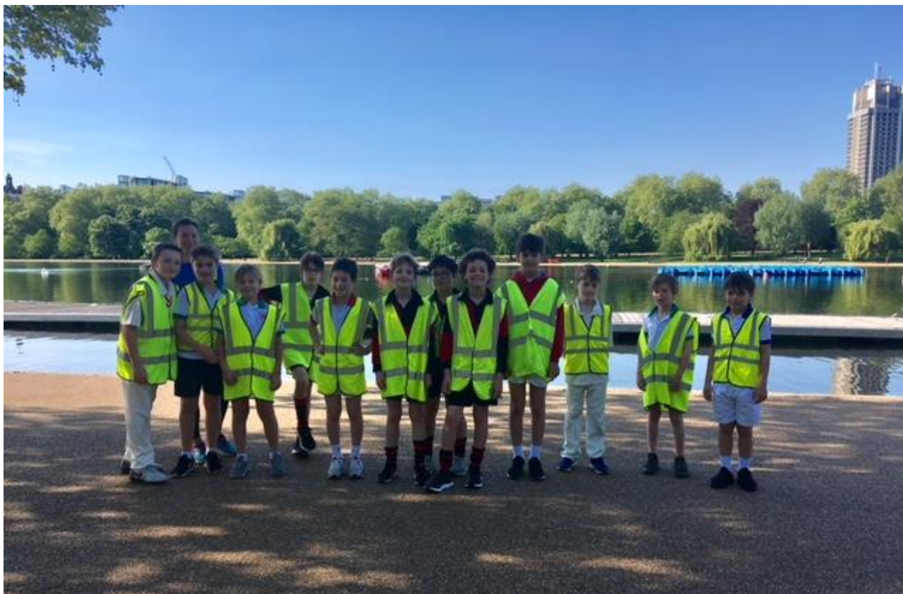
Run Club by the Serpentine