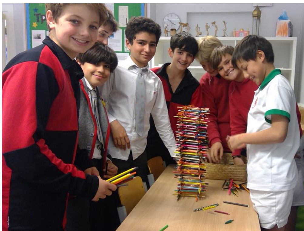
7B's attempt to see how high their pencil tower can go!