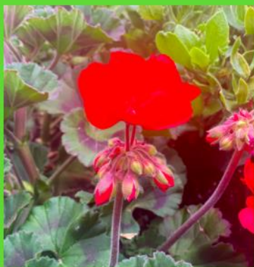
Mr Thorne's beautiful red Earth Day flower.